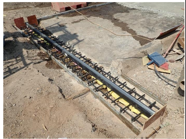
Installation of Expansion Joint (L= 3.65m) at A1 R/S on 23 rd February 2023.