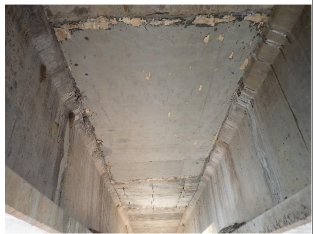
Concrete casting for for the Expose area on Existing Deck Slab on 20 th February 2023. (Trial Mix of Compact Jet Concrete; CPJ 1.05m 3 )