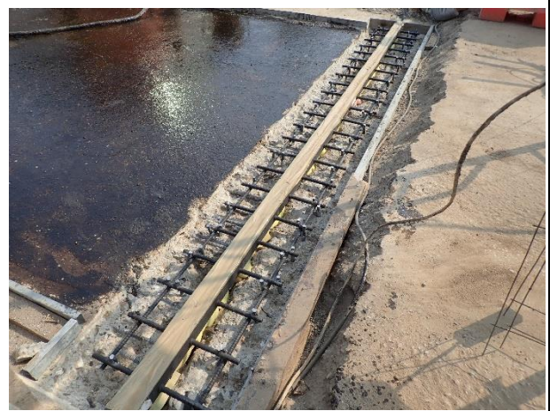
Installation of Expansion Joint (L= 3.49 m) at A1 L/S on 25 th February 2023.