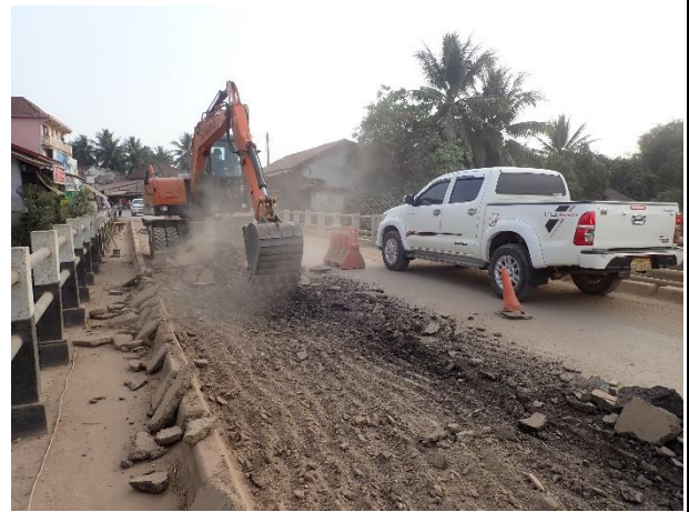
Removal of Existing pavement work on Bridge Surface Right side on 15 th February 2023