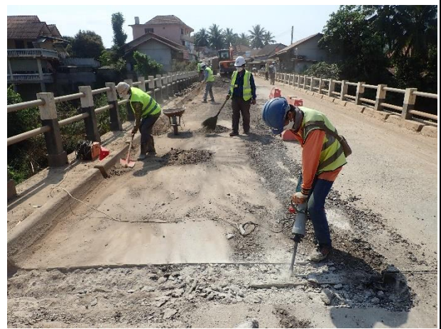
Removal of Existing pavement work on Bridge Surface Right side on 16 th February 2023