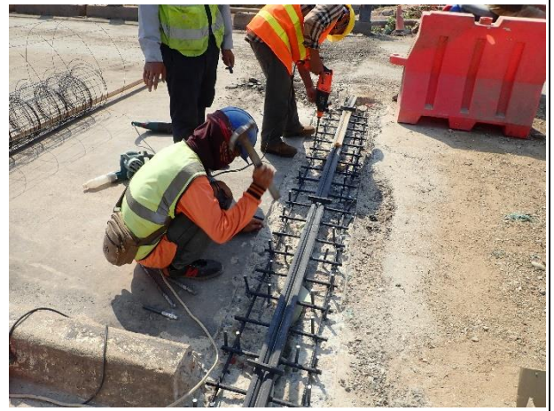
Installation of Expansion Joint (L= 3.65m) at A2 R/S on 19-20 th February 2023.