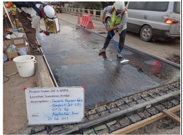
Installation of Expansion Joint (L= 3.65m) at A2 R/S on 20 th February 2023.