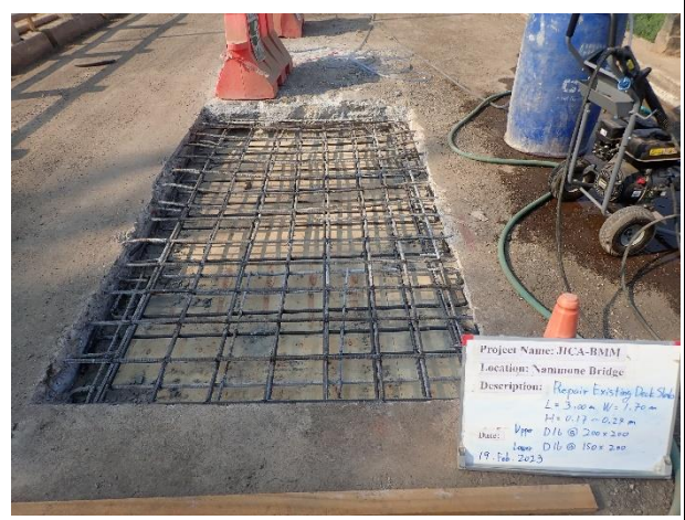
Inspection for Reinforcing bar and Formwork for the Expose area on Existing Deck Slab on 19 th February 2023. (L= 3.00m, W= 1.70m, H= 0.17 – 0.24m)