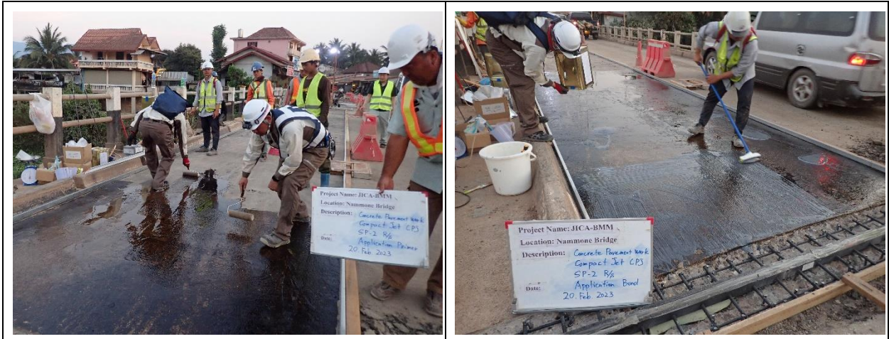
Application of Primer cort and Glue on the Existing Bridge Surface on 20 th February 2023