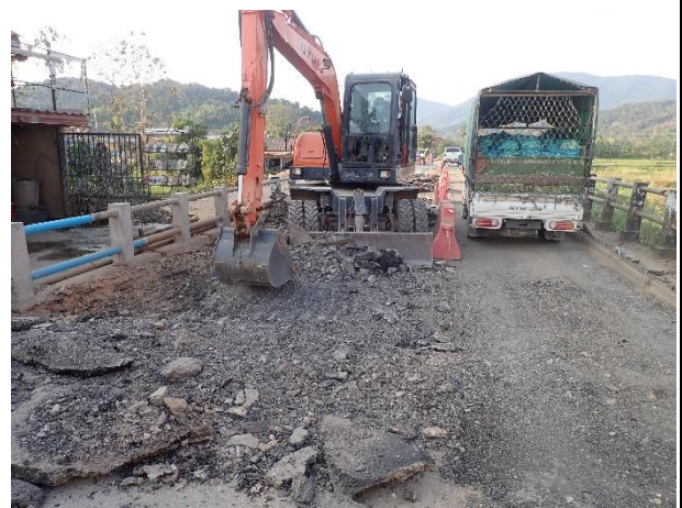
Removal of Existing pavement work on Bridge Surface Left side on 16 th February 2023