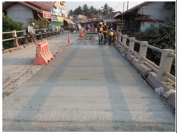
Compact Jet Concrete casting on Bridge Surface Span 1 - Span 2 L/S on 24 th February 2023. (SP 1 – SP 2 L/S: W= 3.25m, L= 17.90m)