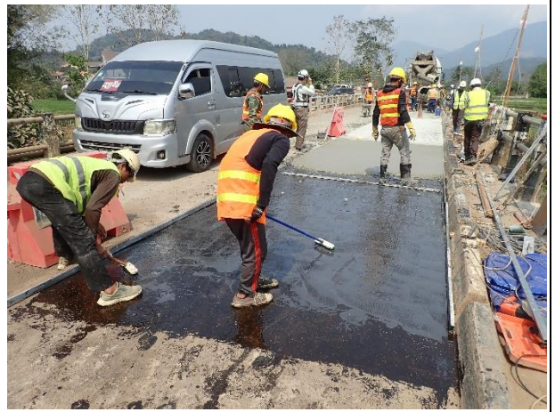
Application of Primer cort and Bond on Bridge Surface Span 2 R/S on 22 nd February 2023. (W= 2.70m, L= 19.3 m)