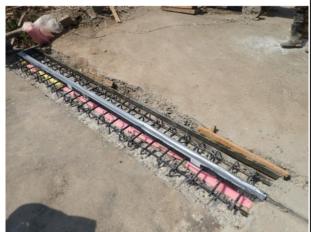
Installation of Expansion Joint (L= 3.48m) at A2 L/S on 23 rd February 2023.