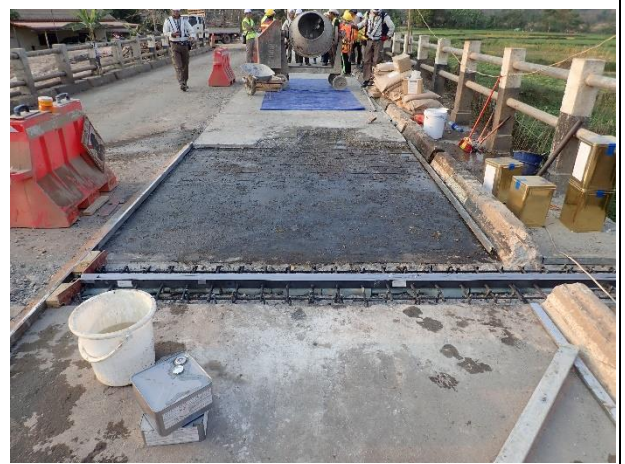
Installation of Expansion Joint (L= 3.65m) at P1 R/S on 21 st February 2023.