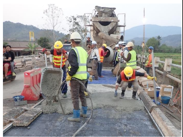
Application of Primer cort and Compact Jet Concrete casting on Bridge Surface Span1-2 R/S on 21 st February 2023. (W= 2.70m, L= 4.0m)