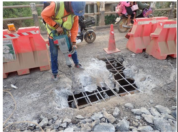
Concrete removal work on 17 th February 2023.