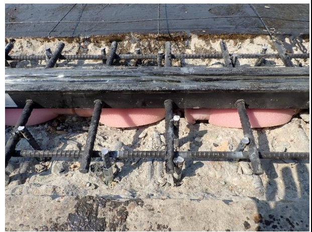
Installation of Expansion Joint (L= 3.46 m) at P1 L/S on 24 th February 2023.