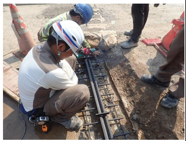
Installation of Expansion Joint at P1 L/S and A1 L/S on 24 th February 2023.