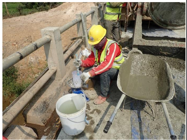
Mixing Compact Jet Concrete casting on 25 th February 2023.