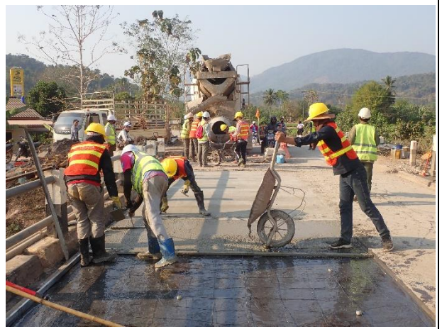
Compact Jet Concrete casting on Bridge Surface Span 1 R/S and Span 2 L/S on 23 rd February 2023. (SP 1 R/S: W= 2.70m, L= 3.5m, SP 2 L/S: W= 3.25m, L= 16.55m)