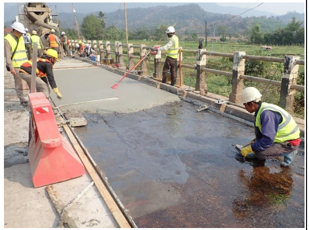
Compact Jet Concrete casting on Bridge Surface Span 2 R/S on 22 nd February 2023. (W= 2.70m, L= 19.3 m)