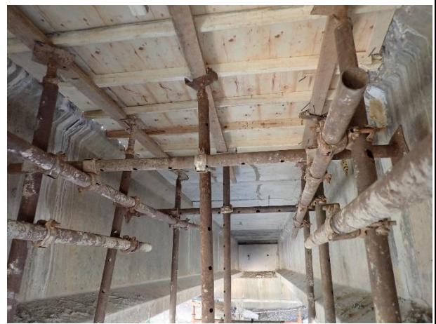
Install additional Reinforcing bar and Formwork on 18-19 th February 2023.