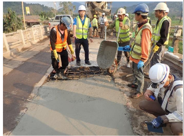
Concrete casting for for the Expose area on Existing Deck Slab on 20 th February 2023. (Trial Mix of Compact Jet Concrete; CPJ 1.05m 3 )