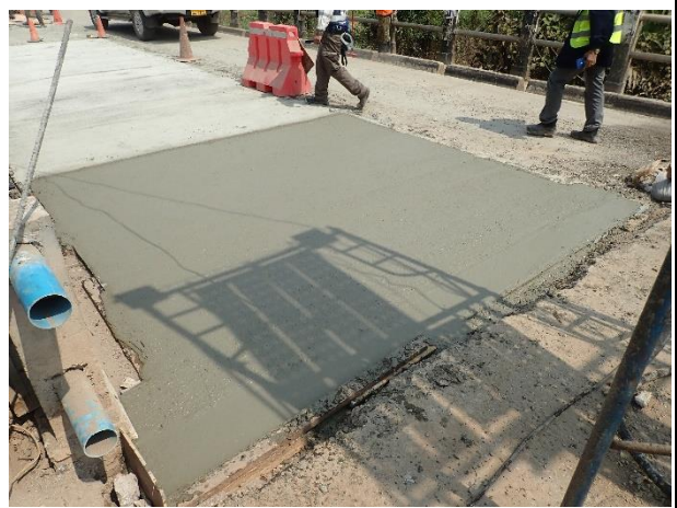
Compact Jet Concrete casting on Bridge Surface Span 1 L/S on 25 th February 2023. (SP 1 L/S: W= 3.25m, L= 11.95m)