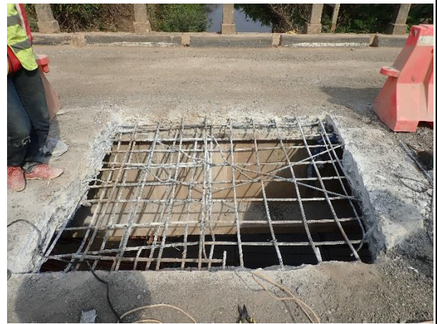
Concrete removal work on 17 th February 2023.