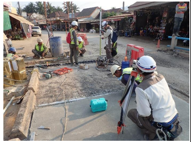
Installation of Expansion Joint at A1 R/S and A2 L/S on 22 nd February 2023.