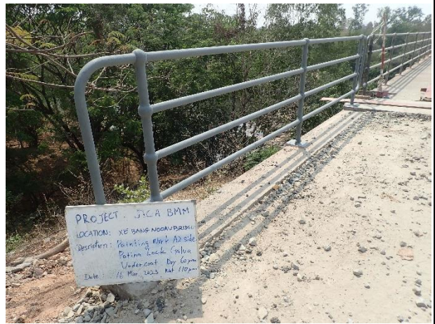
Under coat Patina Lock Galva PL-G on 16 th March 2023. Steel Girder web 3.00m, flange 7.00m, Steel Member, Handrail