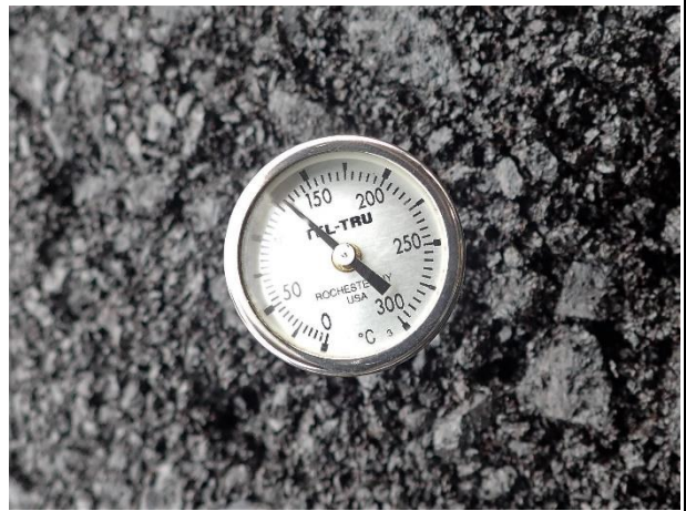
Asphalt pavement work on Approach road A2 R/S on 7 th April 2023