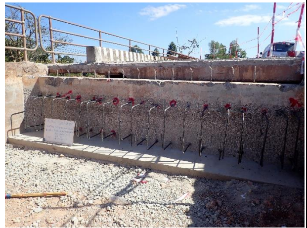
Anchor rebar insert to Existing concrete wall on 28 th December 2022.

Upper side D16 x19 pieces, Lower side D16 x19 pieces