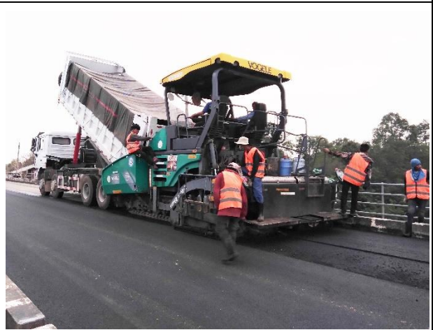
Asphalt pavement work on Bridge Surface L/S on 7 th April 2023