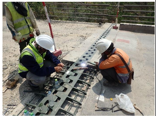
Installation of Expansion Joint at Abutment 2 Left side on 5 th March 2023