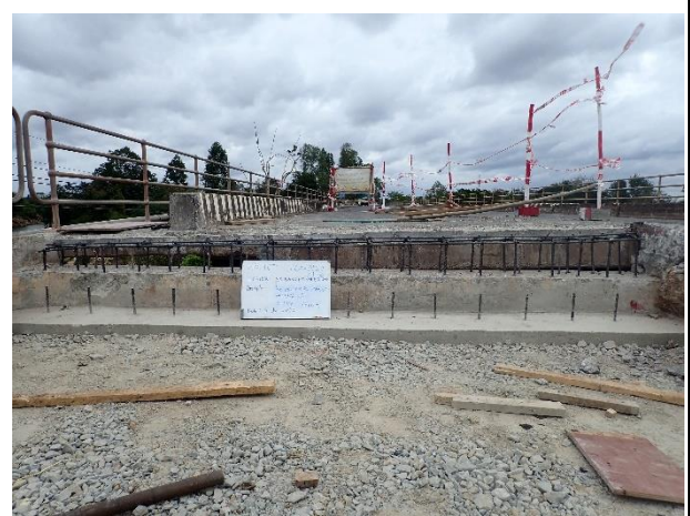
Inspection for Re-bar work on 6 th January 2023.