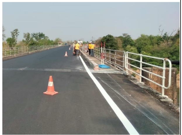
Edge line marking (Solid white line W=15cm) on Bridge Surface and Approach Road on 21 st April 2023