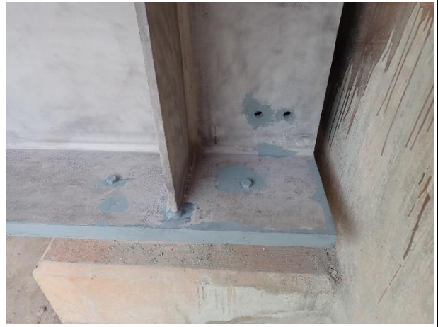
Under coat Patina Lock Galva PL-G on 16 th March 2023. Steel Girder web 3.00m, flange 7.00m, Steel Member, Handrail