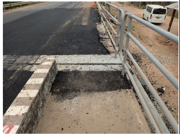
Completion of Asphalt pavement work at near the Expansion joint on 8 th April 2023