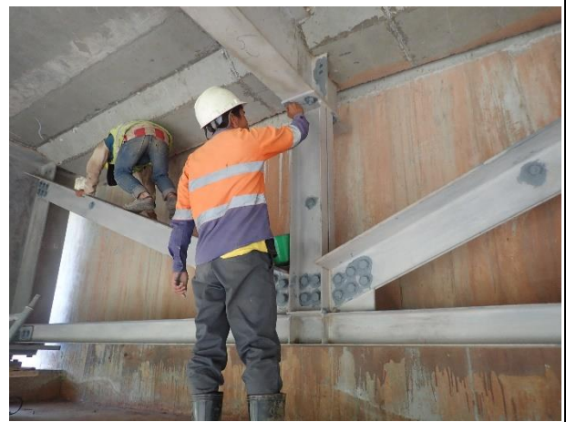
Under coat Patina Lock Galva PL-G on 16 th March 2023. Steel Girder web 3.00m, flange 7.00m, Steel Member, Handrail