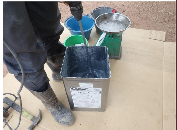
Under coat Patina Lock Galva PL-G on 16 th March 2023. Steel Girder web 3.00m, flange 7.00m, Steel Member, Handrail