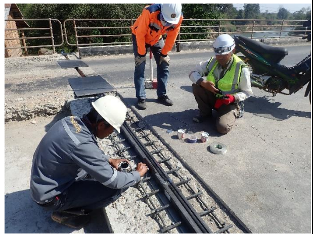
Installation of Expansion Joint at Abutment 1 Right side on 3 rd March 2023