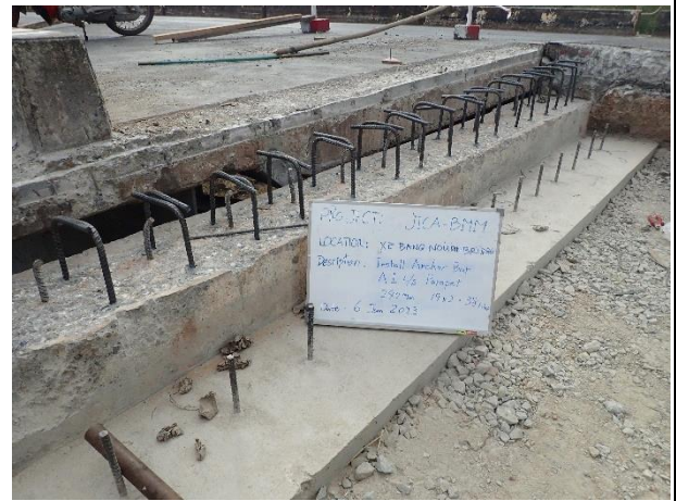
Install Anchor bar for Parapet work on 6 th January 2023.