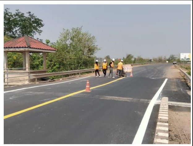
Center line marking (Solid yellow line W=15cm) on Bridge Surface and Approach Road on 21 st April 2023