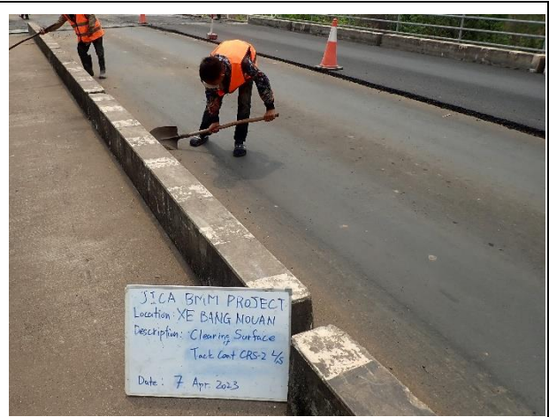
Cleaning Surface Tack coat (CRS-2) on Bridge Surface L/S on 7 th April 2023