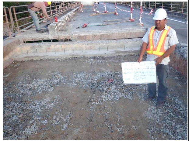
Backfilling by Crushed stone 4 th Layer on 4 th January 2023.