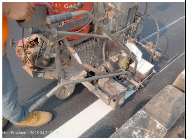
Edge line marking (Solid white line W=15cm) on Bridge Surface and Approach Road on 21 st April 2023