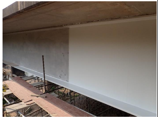
Second coat Patina Lock PL-MET on 17 th March 2023. Steel Girder web 3.00m, flange 7.00m, Steel Member, Handrail