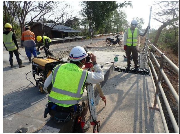
Assembly of Expansion Joint and setting at Abutment 2 Right side on 3-4 th March 2023