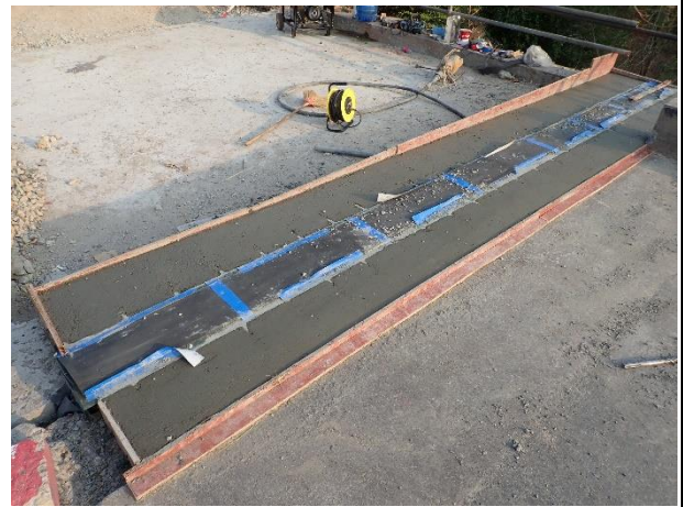
Casting Concrete of Expansion Joint at Abutment 2 Right side on 5 th March 2023