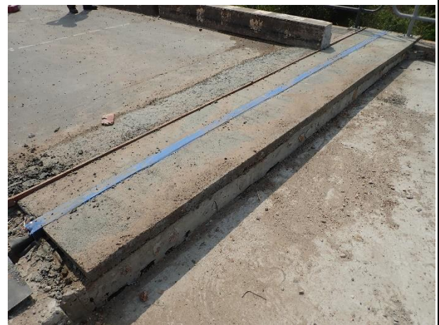
Completion Replacement of Expansion Joint at Abutment 1 site on 14 th March 2023