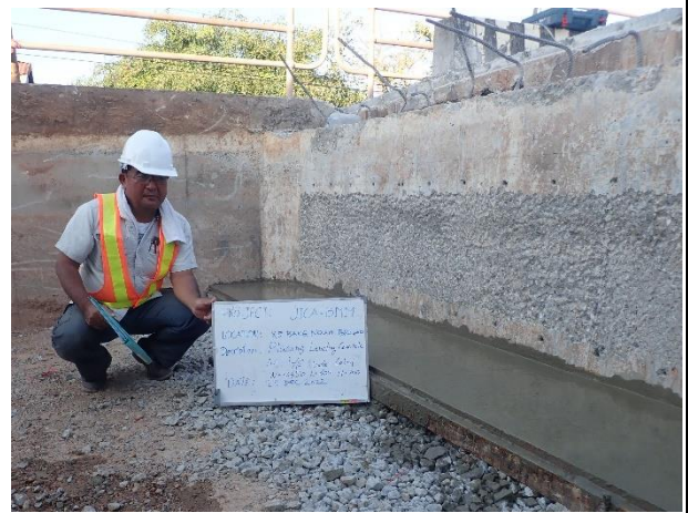
Leveling concrete under the Concrete Corbel on 23 rd December 2022.