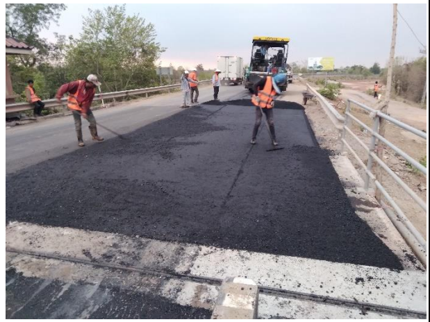
Asphalt pavement work on Approach road A1 L/S on 7 th April 2023