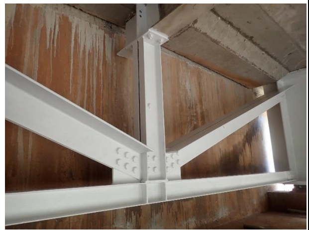
Second coat Patina Lock PL-MET on 17 th March 2023. Steel Girder web 3.00m, flange 7.00m, Steel Member, Handrail