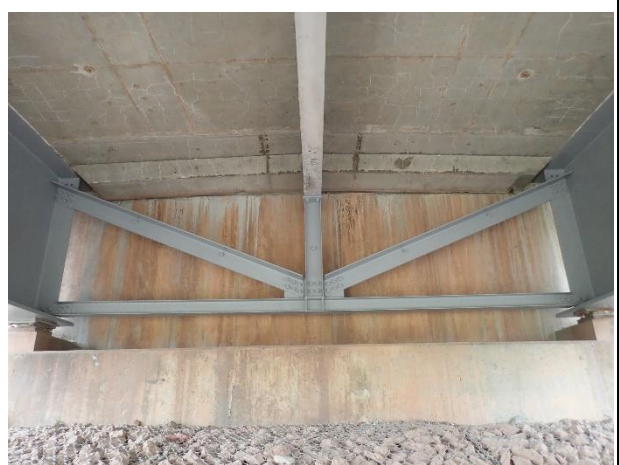
Completion of repainting work A1 side on 19 th March 2023. Steel Girder web 3.00m, flange 7.00m, Steel Member