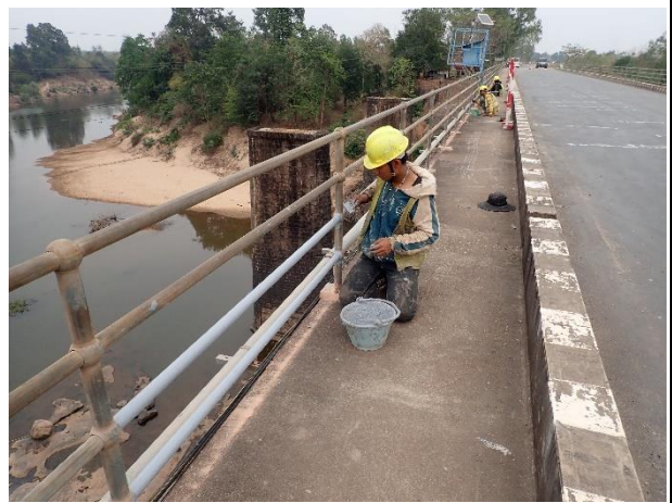
Painting work with TERMARUST on 19-20 th March 2023. Handrail 145m, Both side