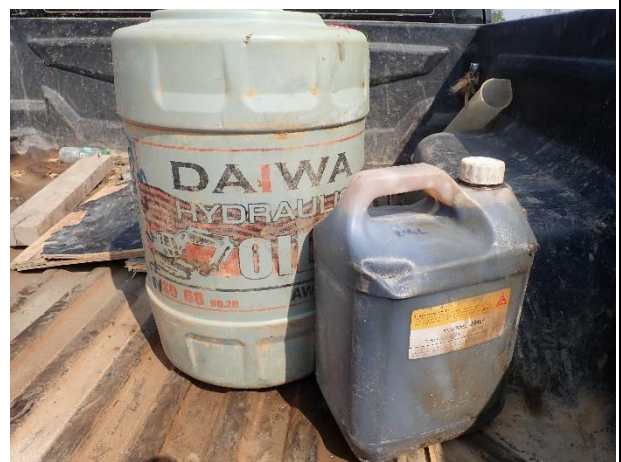
Portland Cement and Admixture Sika plast-204L on 5 th March 2023