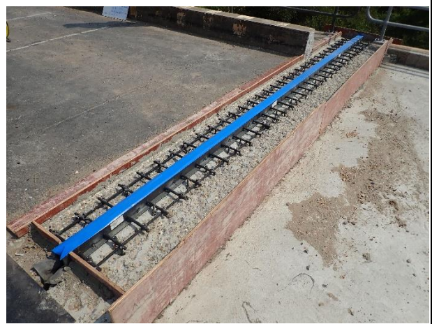
Installation of Expansion Joint at Abutment 1 Right side on 5 th March 2023