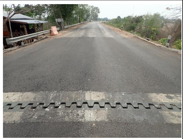
Completion of Asphalt pavement work on Approach road A1 & A2 on 8 th April 2023