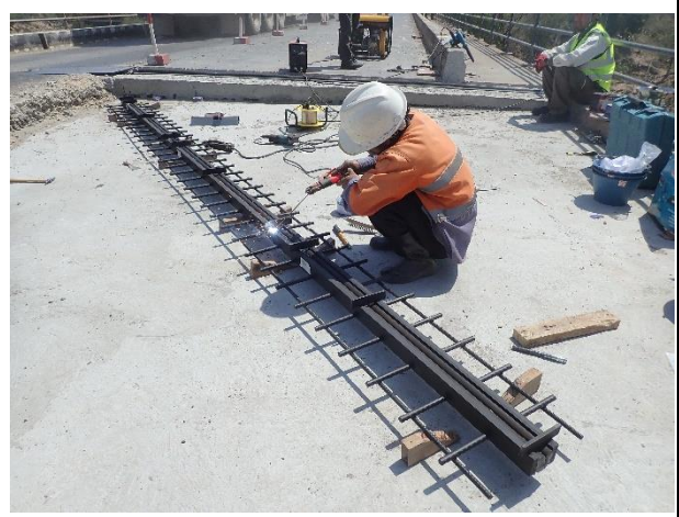
Assembly of Expansion Joint at Abutment 1 Right side on 2 nd March 2023