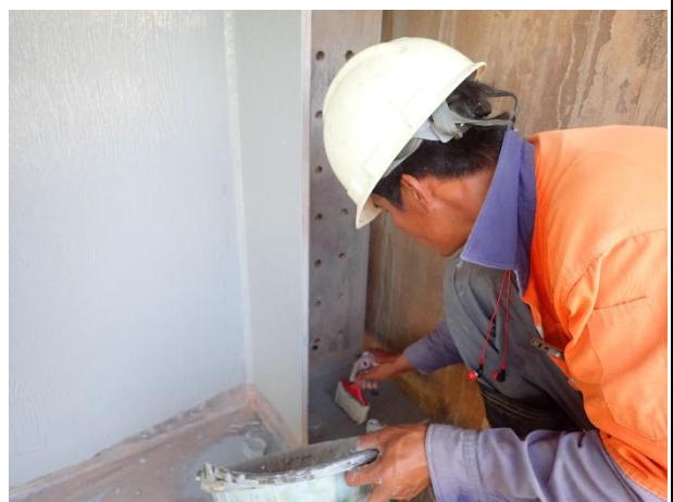
Painting work with TERMARUST on 10 th March 2023.

Steel Girder web 3.00m, flange 7.00m, Steel Member