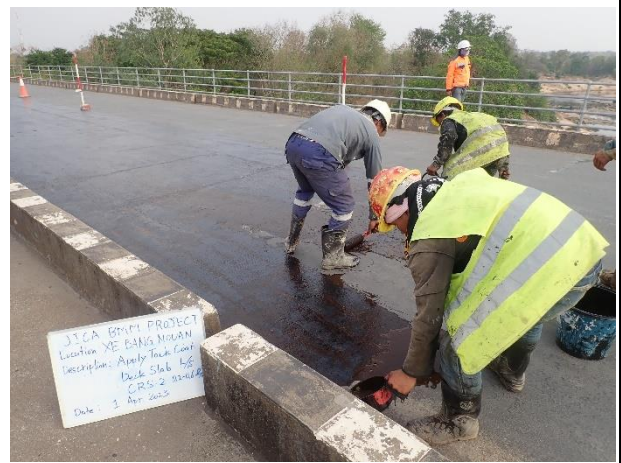
Apply Tack Coat (CRS-2) on Bridge Surface L/S on 1 st April 2023