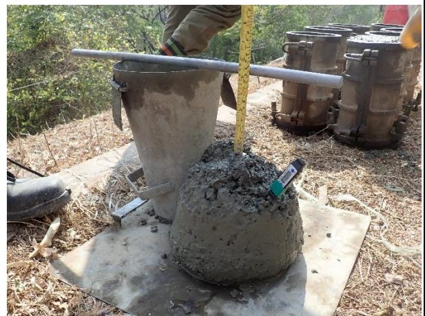
Concrete Mixing (Cement 50kg, Water 17.52kg, Fine Agg. 55.9kg, Course Agg. 103.33kg) with Admixture Sika plast-204L 0.48kg, Slump 13.0cm, Temperature 32°C