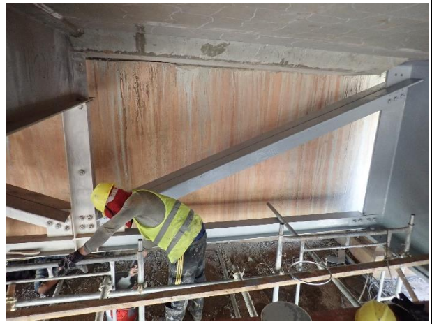
Painting work with TERMARUST on 11-12 th March 2023. Steel Girder web 3.00m, flange 7.00m, Steel Member