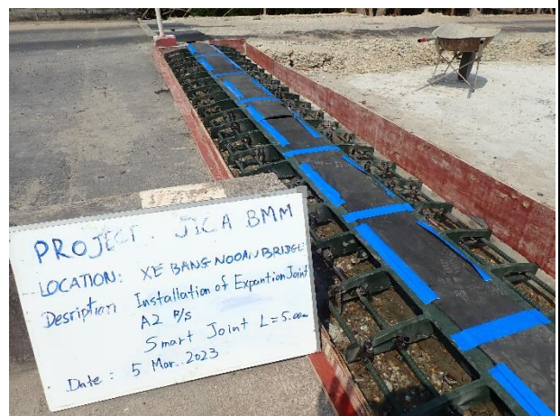
Installation of Expansion Joint at Abutment 2 Right side on 5 th March 2023