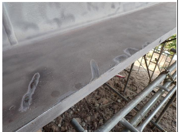
Preparation of the Steel Surface and Cleaning on 14 th March 2023. Steel Girder web 3.00m, flange 7.00m, Steel Member, Handrail