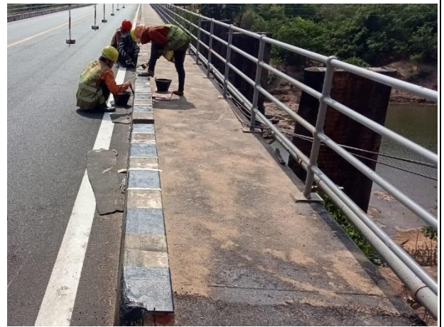
Apply Tack coat (CRS-2) and Sprinkle Quartz sand on Bridge Surface L/S on 25 th April 2023