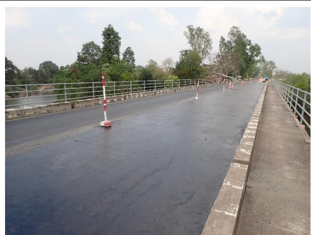
Apply Tack Coat (CRS-2) on Bridge Surface R/S on 3 rd April 2023