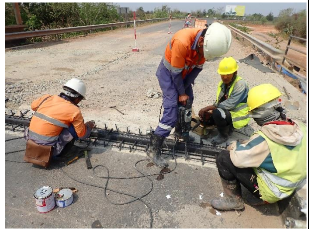
Installation of Expansion Joint at Abutment 1 Left site on 9 th March 2023