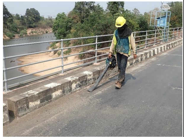
Cleaning work on Bridge Surface L/S on 1 st April 2023