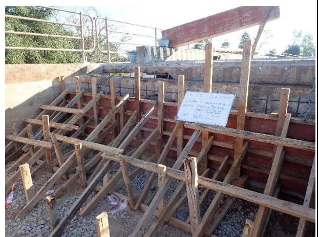
Form work on 29-30 th December 2022.