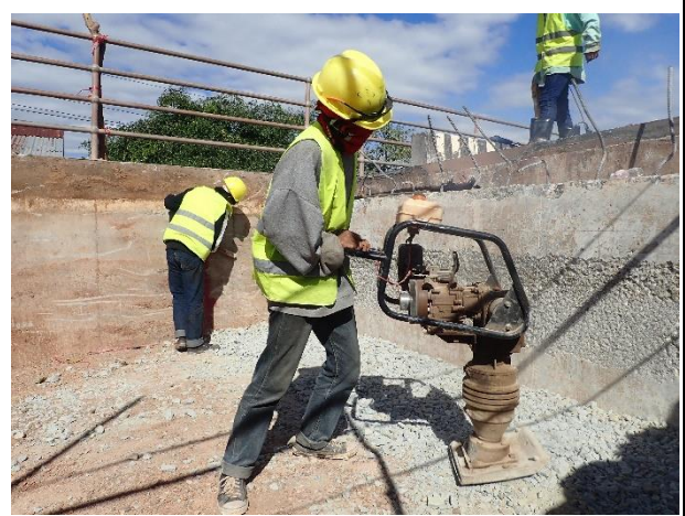
Foundation compaction work under the Concrete Corbel on 21 st December 2022.