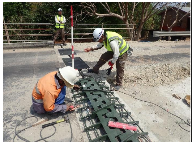
Installation of Expansion Joint at Abutment 2 Right side on 4 th March 2023