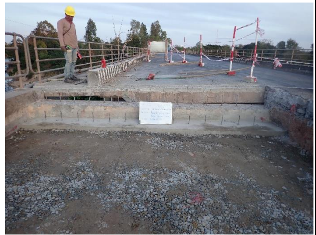
Backfilling by Crushed stone 4 th Layer on 4 th January 2023.