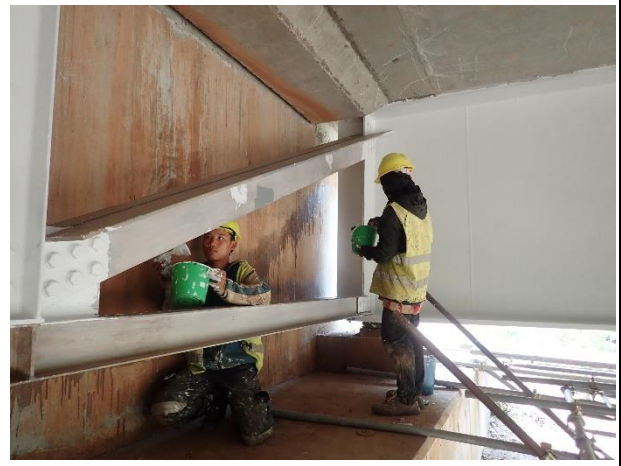
Second coat Patina Lock PL-MET on 17 th March 2023. Steel Girder web 3.00m, flange 7.00m, Steel Member, Handrail