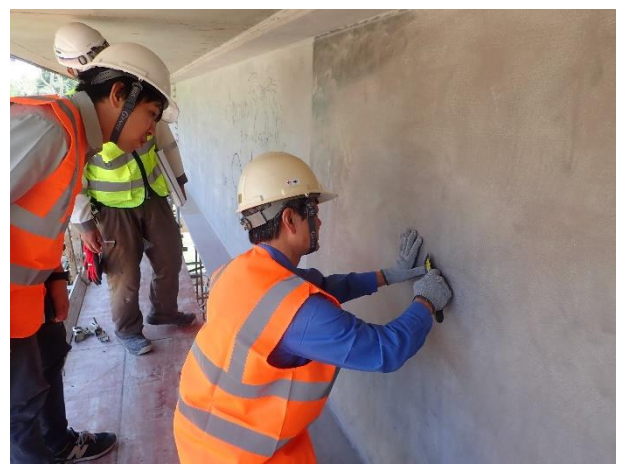
Preparation of the Steel Surface and Cleaning on 1-5 th March 2023. Steel Girder web 3.00m, flange 7.00m, Steel Member, Handrail