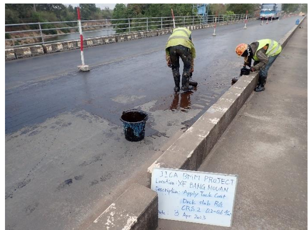
Apply Tack Coat (CRS-2) on Bridge Surface R/S on 3 rd April 2023