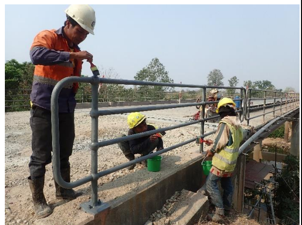
Under coat Patina Lock Galva PL-G on 16 th March 2023. Steel Girder web 3.00m, flange 7.00m, Steel Member, Handrail