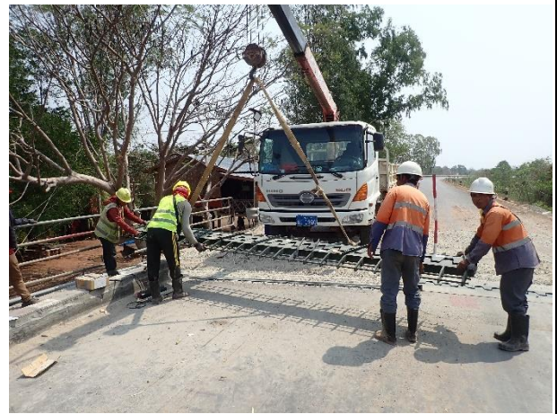
Assembly of Expansion Joint and setting at Abutment 2 Left side on 9-10 th March 2023