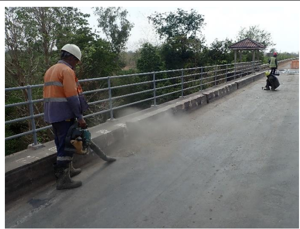
Cleaning work on Bridge Surface R/S on 3 rd April 2023