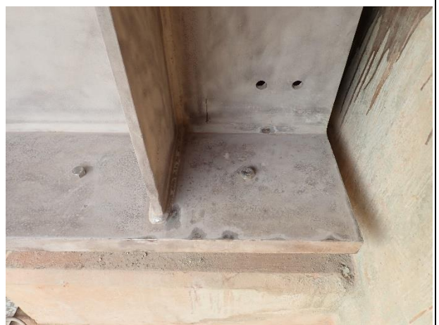
Preparation of the Steel Surface and Cleaning on 15 th March 2023. Steel Girder web 3.00m, flange 7.00m, Steel Member, Handrail