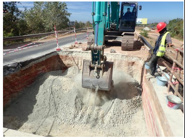
Backfilling by Soil cement 2 nd Layer on 4 th January 2023.

Base course 5.0 m 3 + Portland Cement 500kg