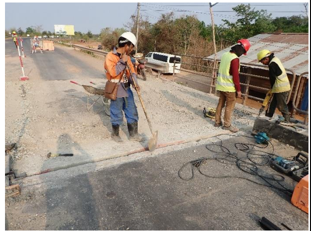
Assembly of Expansion Joint and cleaning work at Abutment 1 Left site on 8-9 th March 2023