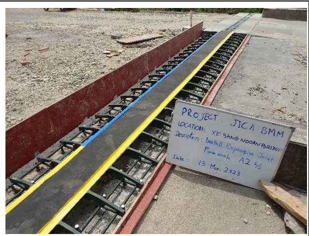
Installation of Expansion Joint and Formwork at Abutment 2 Left side on 13 th March 2023