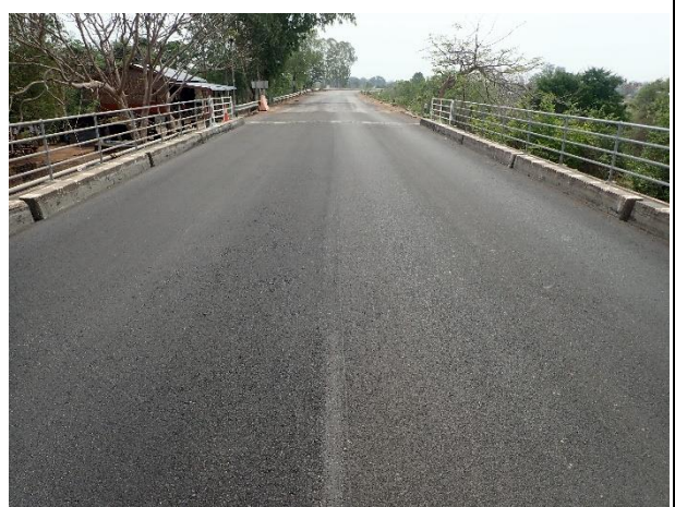
Completion of Asphalt pavement work on Bridge Surface 80 – 140 m from A1 side on 8 th April 2023