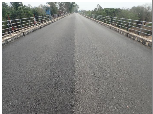
Completion of Asphalt pavement work on Bridge Surface 0 – 80 m from A1 side on 8 th April 2023