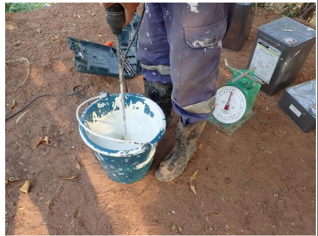
Top coat Patina Lock PL-MFT on 18 th March 2023.

Steel Girder web 3.00m, flange 7.00m, Steel Member, Handrail