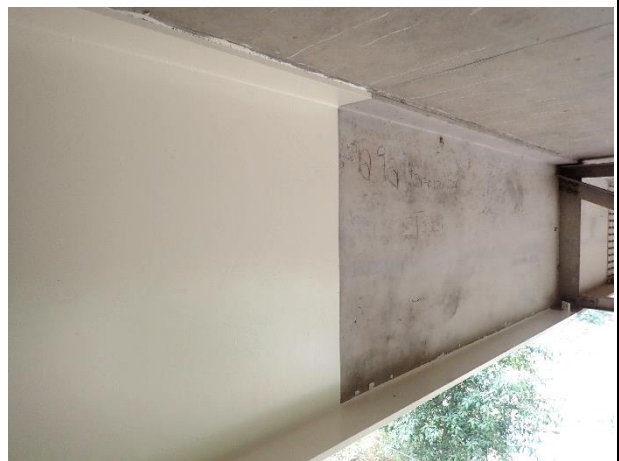
Completion of repainting work A2 side on 19 th March 2023.

Steel Girder web 3.00m, flange 7.00m, Steel Member, Handrail