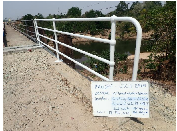
Second coat Patina Lock PL-MET on 17 th March 2023.

Steel Girder web 3.00m, flange 7.00m, Steel Member, Handrail