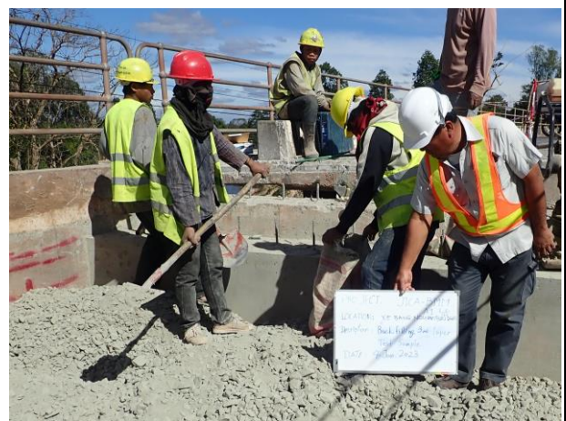
Backfilling by Soil cement 3 rd Layer on 4 th January 2023.

Base course 5.0 m 3 + Portland Cement 500kg (Take a Test Sample)