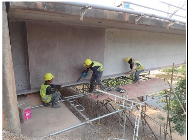
Preparation of the Steel Surface and Cleaning on 14 th March 2023. Steel Girder web 3.00m, flange 7.00m, Steel Member, Handrail