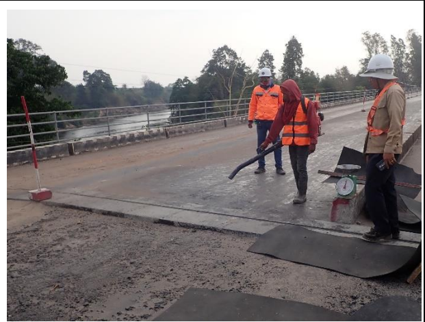
Cleaning Surface Tack coat (CRS-2) on Bridge Surface R/S on 6 th April 2023

JICA BMM PROJECT Location: XE BANG NOUAN Description: Cleaning Surface Tack Coat CRS-2 8% Date: 6 Apr 2023