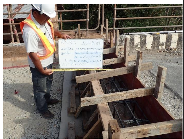
Inspection for Form work on 6 th January 2023.