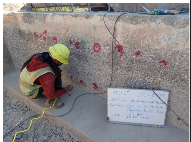
Concrete Drilling work for anchor holes on 24-28 th December 2022.