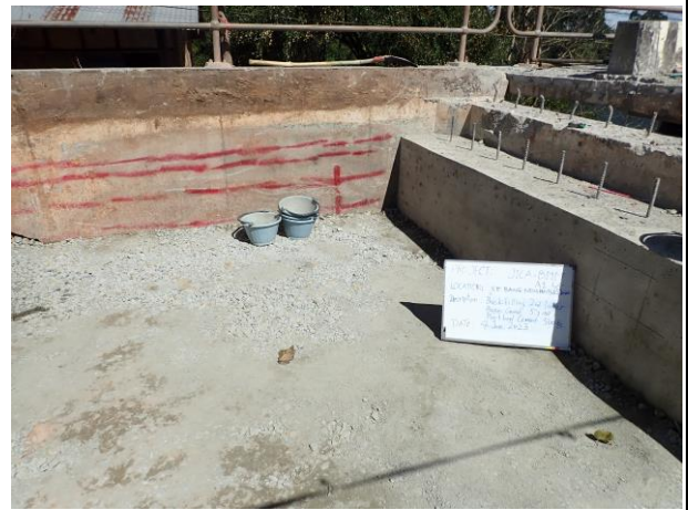
Backfilling by Soil cement 2 nd Layer on 4 th January 2023.

Base course 5.0 m 3 + Portland Cement 500kg