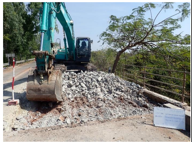
Removal of Existing pavement work on Approach Road Right side on 30 January -1 st February 2023