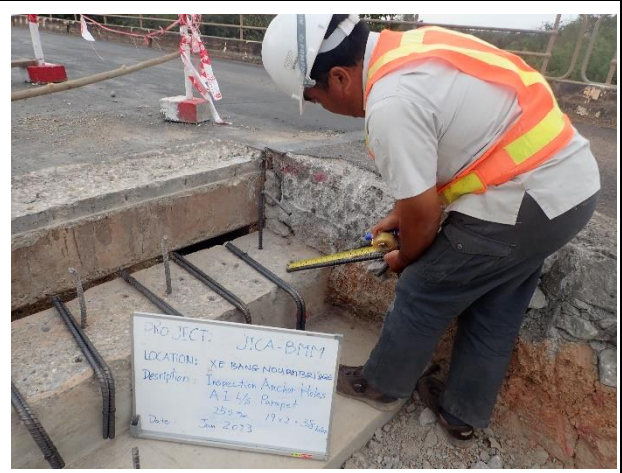
Inspection for Anchor holes for Parapet work on 6 th January 2023.