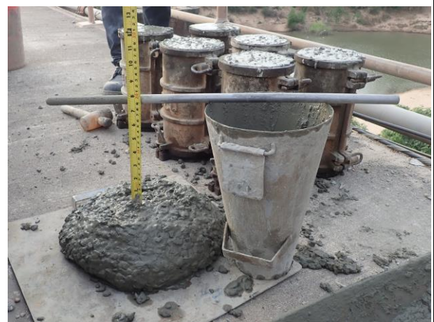
Concrete Mixing (Cement 25kg, Water 8.76kg, Fine Agg. 28.0kg, Course Agg. 51.66kg) with Admixture Sika plast-204L 0.24kg, Slump 18.5cm