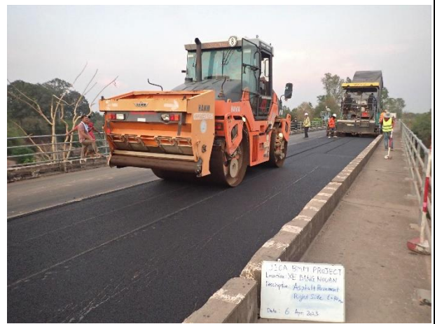
Asphalt pavement work on Bridge Surface R/S on 6 th April 2023