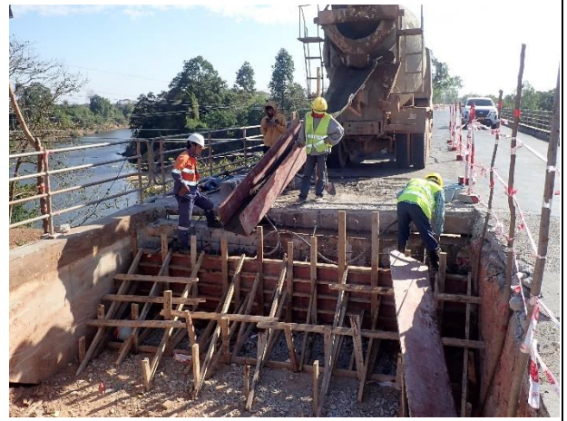
Concrete Casting for Concrete Corbel Abutment 1 Left side on 30 th December 2022.