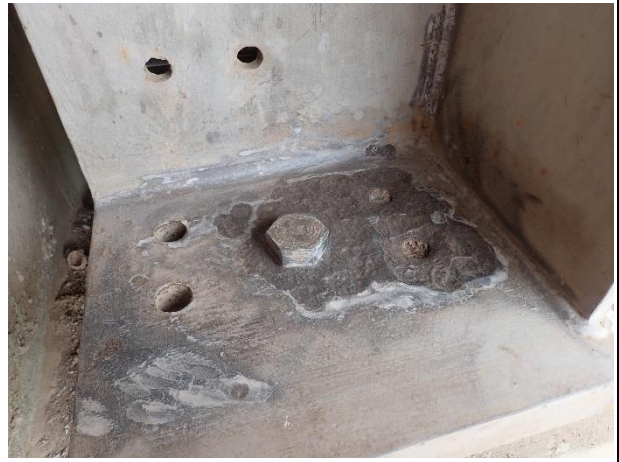
Preparation of the Steel Surface and Cleaning on 11 th March 2023.

Steel Girder web 3.00m, flange 7.00m, Steel Member