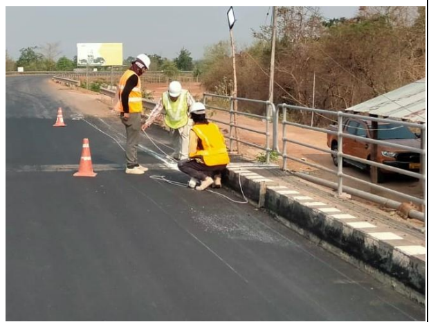
Cleaning and Preparation of Road Marking on Bridge Surface and Approach Road on 21 st April 2023