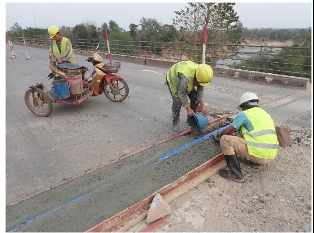
Casting Concrete of Expansion Joint at Abutment 1 Left site on 13 th March 2023