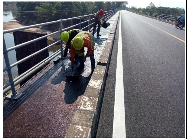
Apply Tack coat (CRS-2) on Bridge Surface Footpath B/S on 25 th April 2023