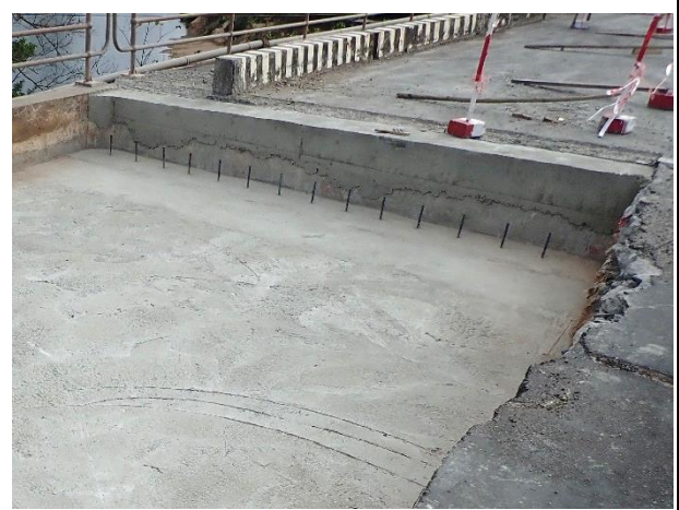
Concrete casting work on 6 th January 2023.

Slump test 12.0 cm, Concrete Temperature 27.5 °C