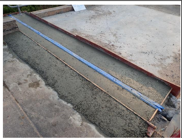
Casting Concrete of Expansion Joint at Abutment 1 Right side on 5 th March 2023