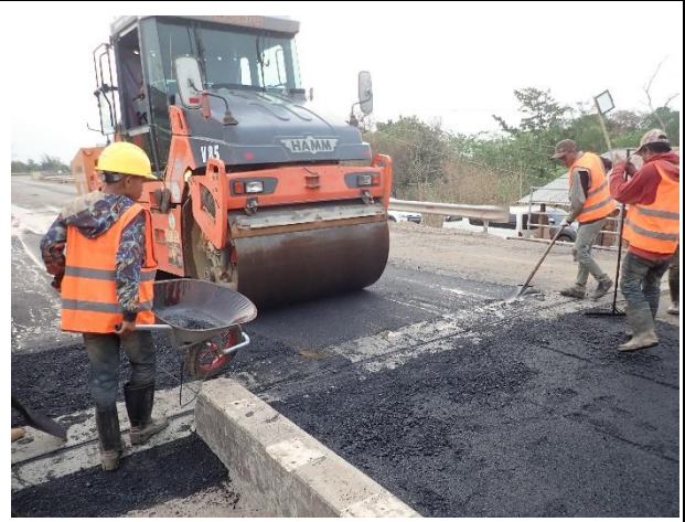
Asphalt pavement work on Approach road A1 R/S on 6 th April 2023