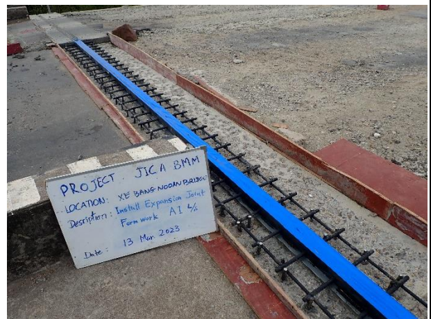
Installation of Expansion Joint and Formwork at Abutment 1 Left site on 13 th March 2023