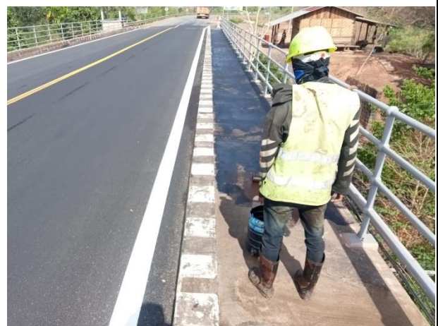
Cleaning and Apply EPS on Bridge Surface Footpath B/S on 24 th April 2023