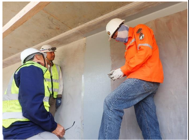
Painting work with TERMARUST on 10 th March 2023.

Steel Girder web 3.00m, flange 7.00m, Steel Member