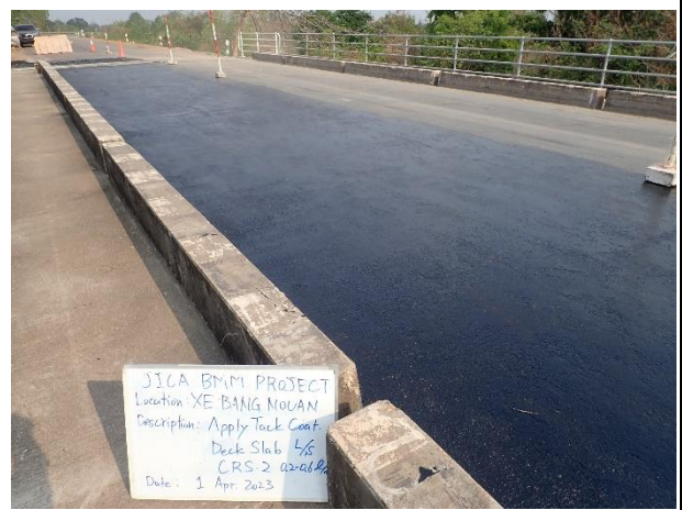
Apply Tack Coat (CRS-2) on Bridge Surface L/S on 1 st April 2023