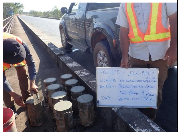
Concrete Casting for Concrete Corbel Abutment 1 Left side on 30 th December 2022. Slump test 10.0 cm, Concrete Temperature 24 °C