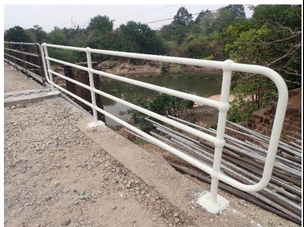
Completion of repainting work A2 side on 19 th March 2023.

Steel Girder web 3.00m, flange 7.00m, Steel Member, Handrail