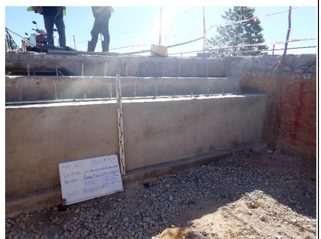
Inspection for Concrete Corbel Abutment 1 Left side on 3 rd January 2023.