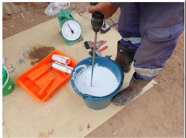
Second coat Patina Lock PL-MET on 17 th March 2023. Steel Girder web 3.00m, flange 7.00m, Steel Member, Handrail