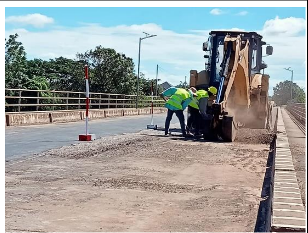
Removal of Existing pavement work on Bridge Surface on 25-30 th November 2022