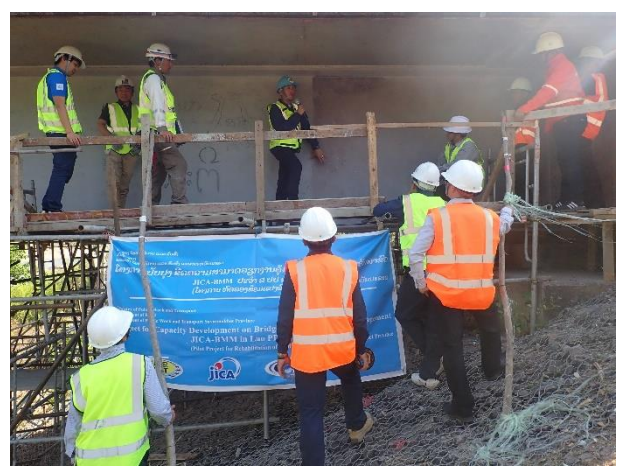
On-site workshop for Painting work on 3 rd March 2023. Steel Girder web 3.00m, flange 7.00m, Steel Member, Handrail