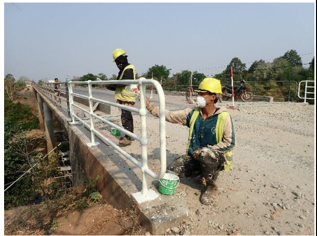
Top coat Patina Lock PL-MFT on 18 th March 2023.

Steel Girder web 3.00m, flange 7.00m, Steel Member, Handrail