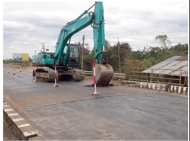
Removal of Existing pavement work on Approach Road Left side on 15-17 th December 2022