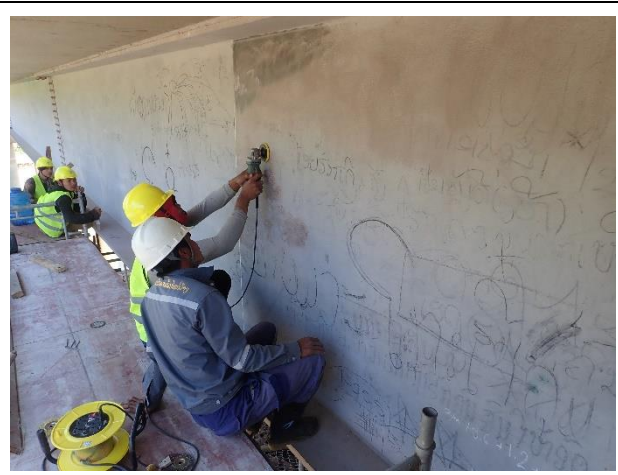
Scaffolding assembly and Cleaning work for the Steel Surface on 1-5 th March 2023. Steel Girder web 3.00m, flange 7.00m, Steel Member, Handrail