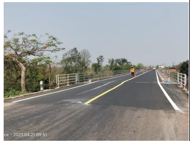
Completion of Road Marking on Bridge Surface and Approach Road on 21 st April 2023