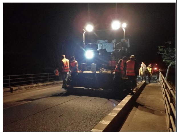
Asphalt pavement work on Bridge Surface R/S on 6 th April 2023