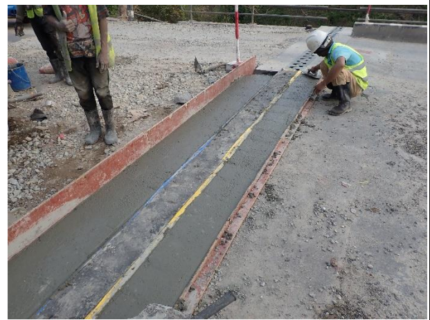
Casting Concrete of Expansion Joint at Abutment 2 Left side on 13 th March 2023