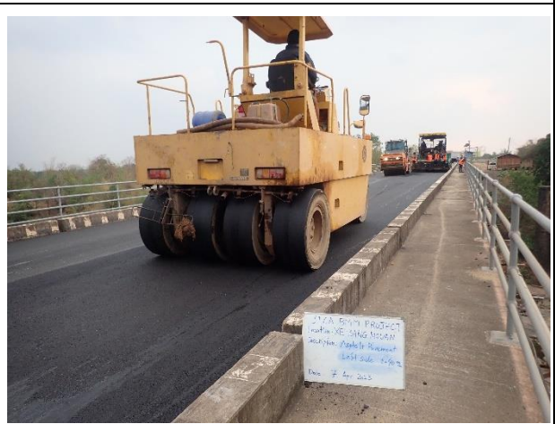
Asphalt pavement work on Bridge Surface L/S on 7 th April 2023