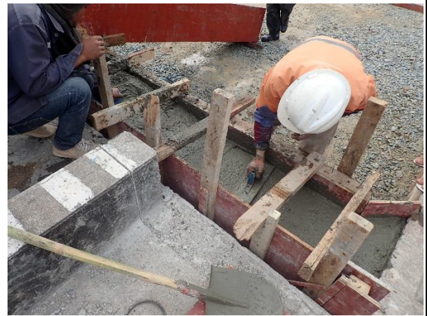
Concrete casting work on 6 th January 2023.

Slump test 12.0 cm, Concrete Temperature 27.5 °C