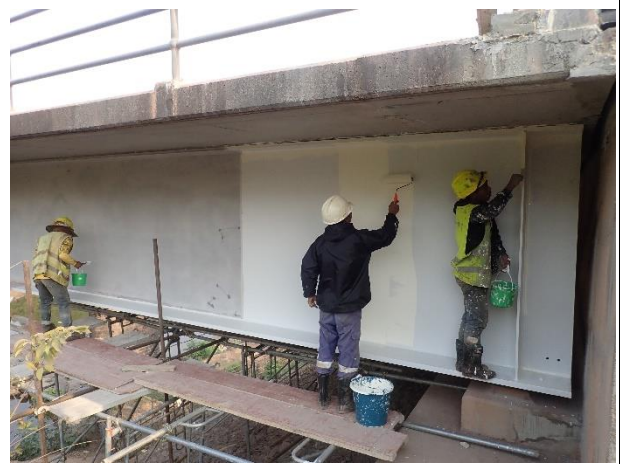
Top coat Patina Lock PL-MFT on 18 th March 2023.

Steel Girder web 3.00m, flange 7.00m, Steel Member, Handrail