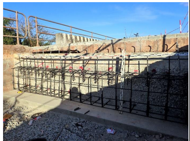
Re-bar work on 28 th December 2022.

19-D16x1240, 19-D16x880, 6-D14x4500, Anchor bar 14-D16x500